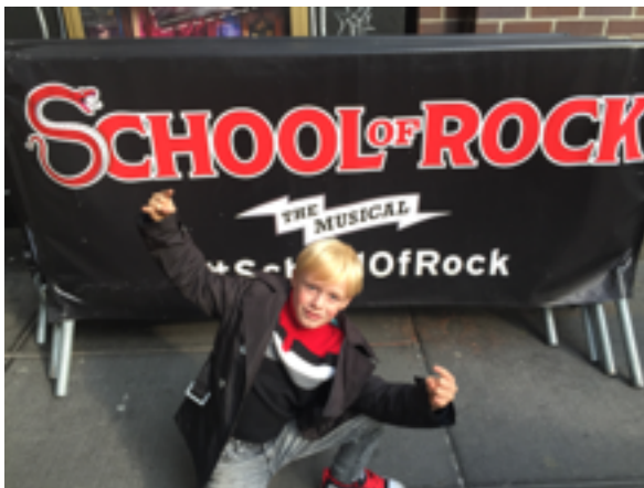
Great new musical for kids. Watch out for excerpts in the concert.