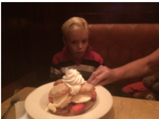
It wasn't all work. We had some yummy food too!